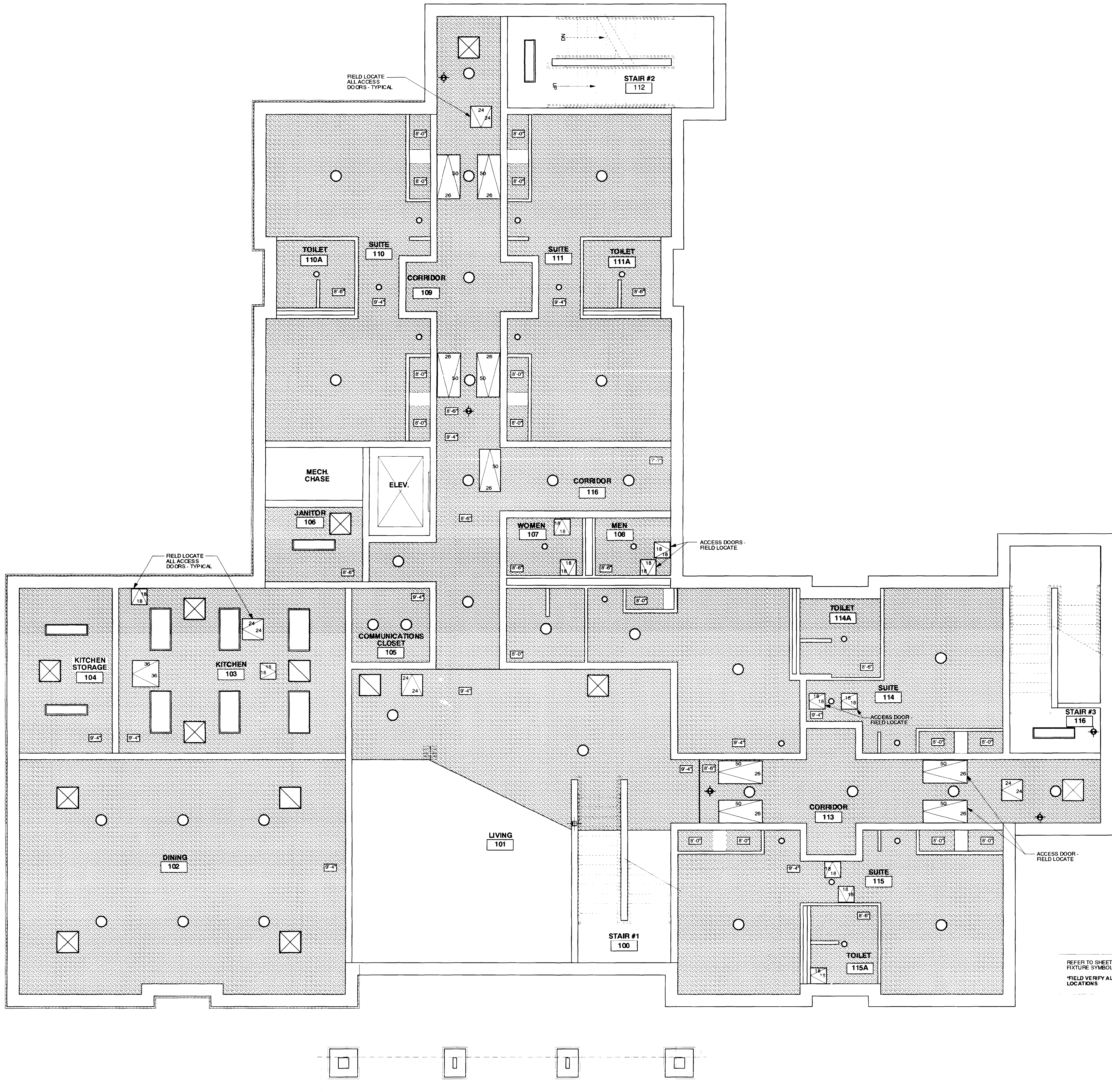
FIRST FLOOR REFLECTED CEILING PLAN - Building 0504 1/4" = 1'-0"